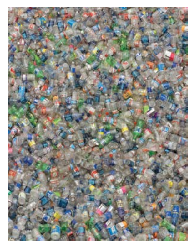
Cover photo: detail of Plastic Bottles, 2007 which depicts two million plastic beverage bottles, the number used in the United States every five minutes. More work at www.chrisjordan.com