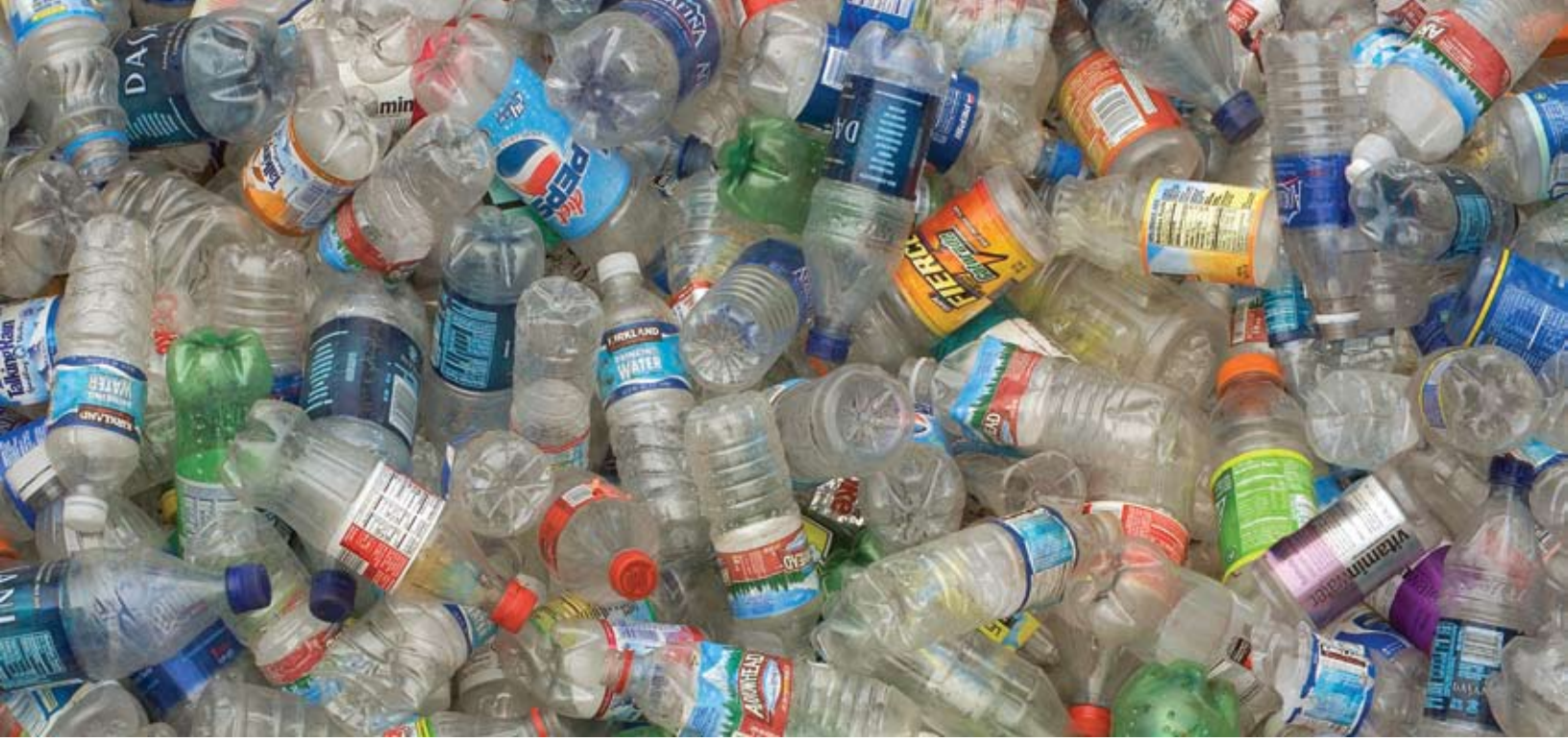
Detail of Plastic Bottles, 2007