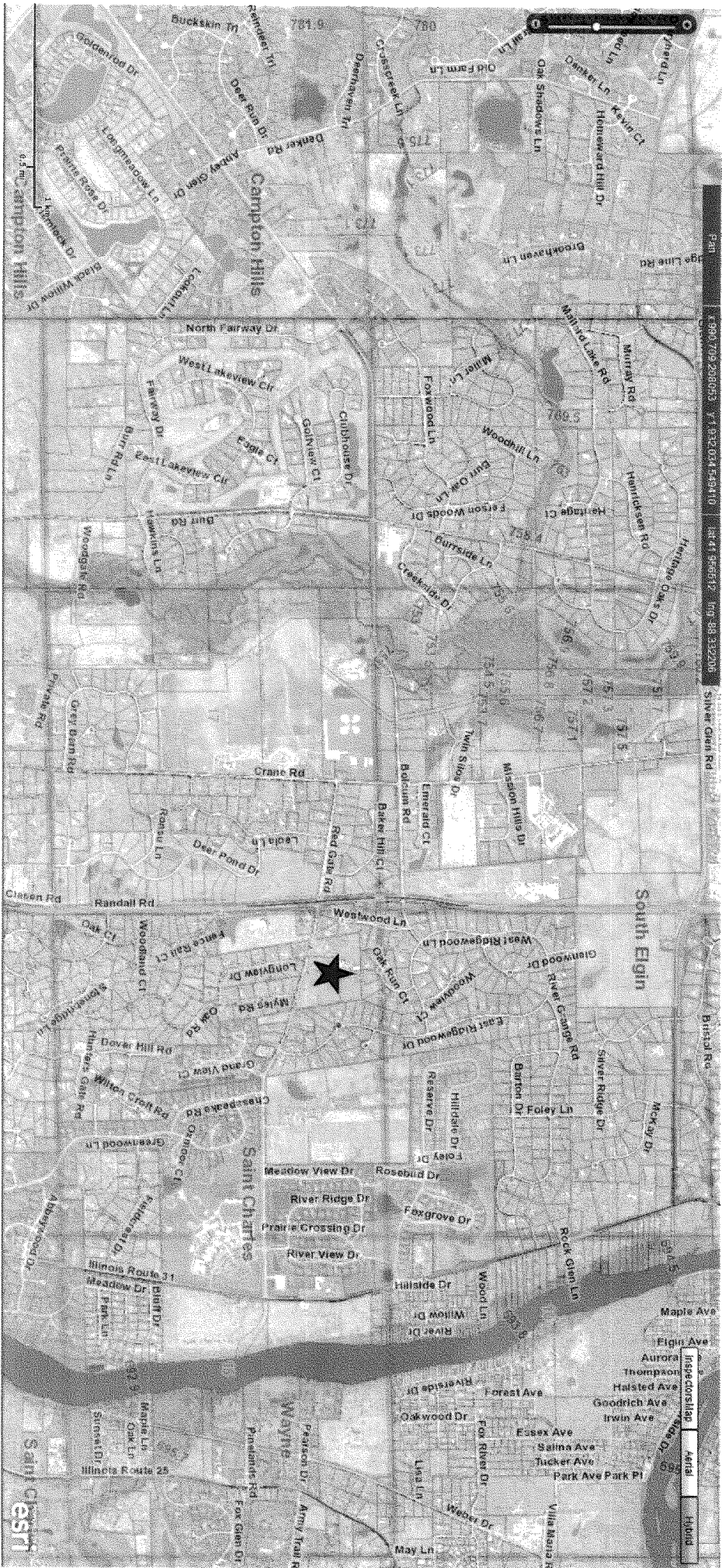
Location of Seven Oaks Farm within the county