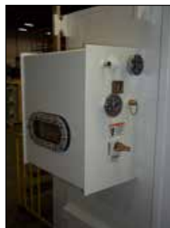
Figure 7. External visible break with gauges.