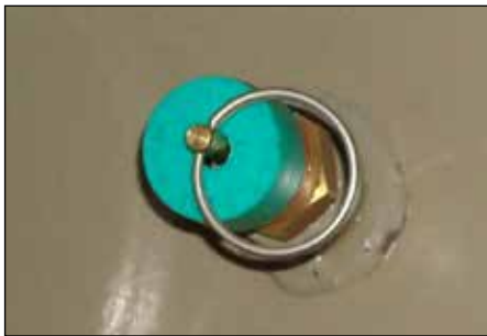
Figure 4. Automatic Pressure relief valve.