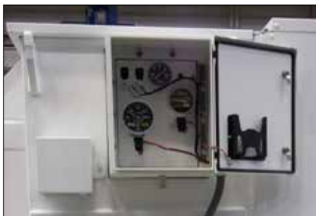
Figure 6. External Gauges.