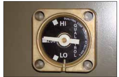
Figure 5. Liquid level gauge.