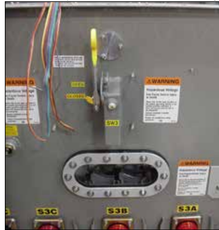
Figure 8. VFI transformer with visible break.

With a fire point of 360 °C, Envirotemp™ FR3™ fluid is FM Approved® and Underwriters Laboratories (UL®) Classified "Less-Flammable" per NEC® Article 450-23, fitting the definition of a Listed