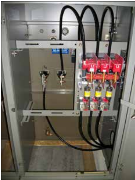
Figure 9. Modular transformer.

An MTU utilizes existing utility infrastructure, therefore eliminating the need to engineer and construct a dedicated communication network.