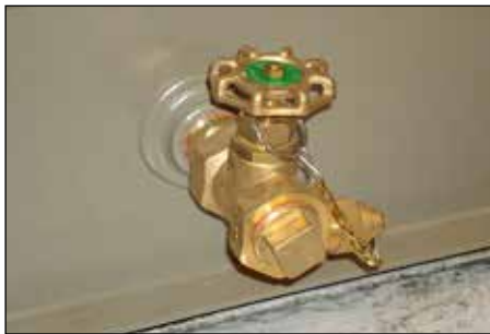
Figure 3. Drain valve with sampler.