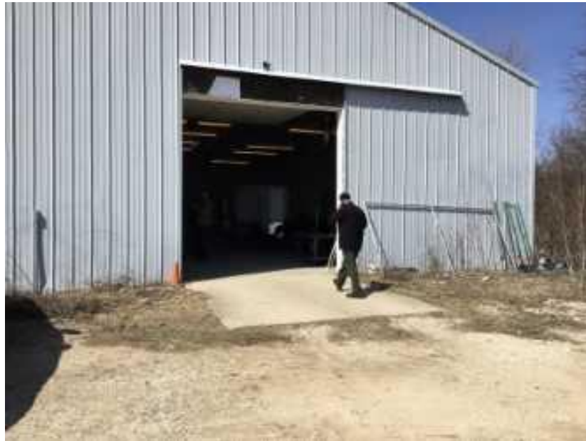
Bomb Squad Exterior