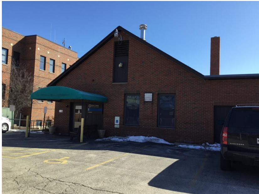
Coroner's Office Exterior