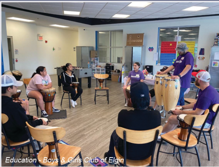
Education - Boys & Girls Club of Elgin