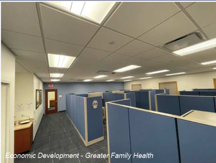
Economic Development - Greater Family Health